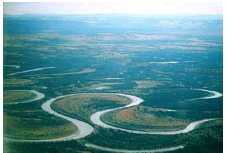
Meanders and Oxbow Lakes on the Nowitna River, Alaska